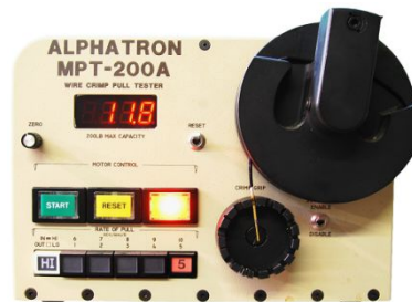
(Values based on M22759/11xx)