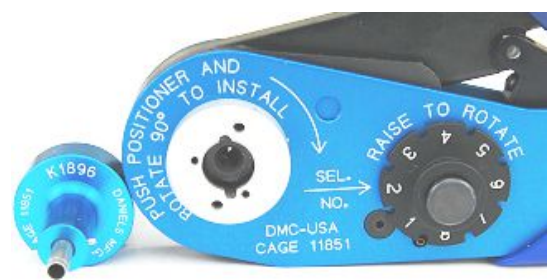
Detail A. (Positioner and Crimp Tool)