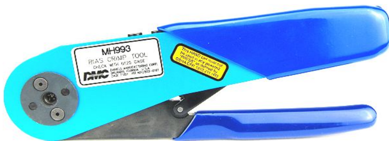
Fig. B. (Crimp Tool 452200-MSP)

STEP 1) From the "Contact Crimp Information" Table, use the crimp tool and positioner set listed.