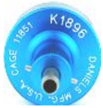
Fig. C. (Positioner)

STEP 2) Insert the Positioner into the Crimp Tool and tighten in place with the two screws in the positioner by aligning the guide pin and guide hole in the “Tool Set” as shown in Fig. C. and D. below.