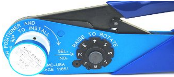
Fig. D. (Positioner inserted into Crimp Tool)

STEP 3) Strip wire to dimensions in “Contact Crimp Information” Table using a ruler/calipers along with a wire stripper as shown in Fig. E.