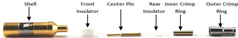
Contact Sub-Assembly Piece Parts.