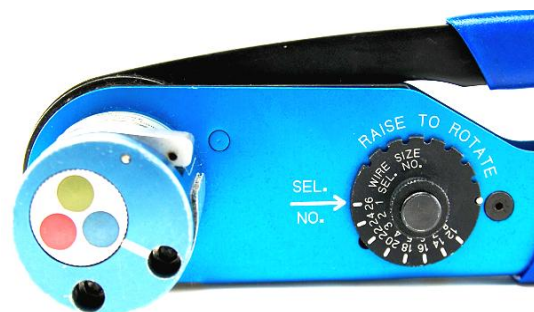
Detail A. (Crimp Tool and Positioner)