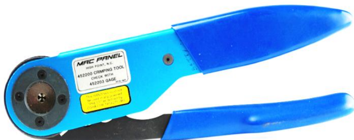
Fig. B. (Crimp Tool 452200)

STEP 1) From the "Contact Crimp Information" Table, use the crimp tool and hex die set listed.